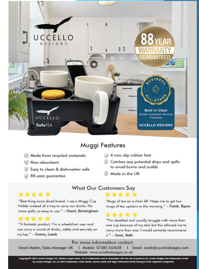
Back of flyer