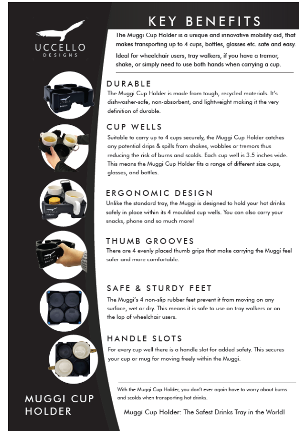
Front of flyer