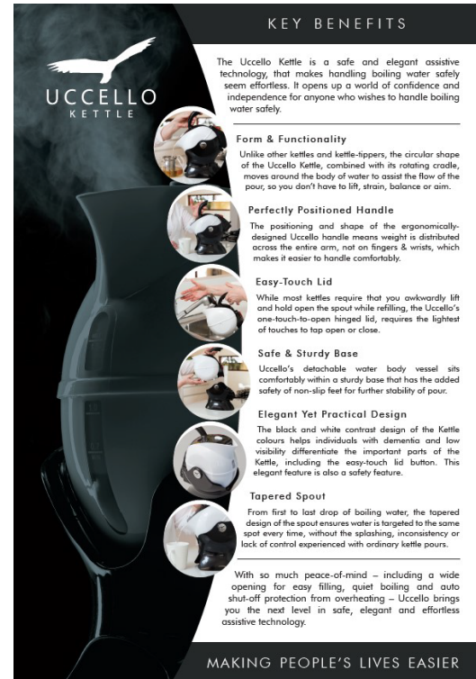
Front of flyer