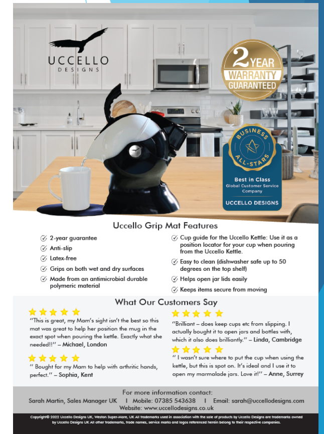
Back of flyer