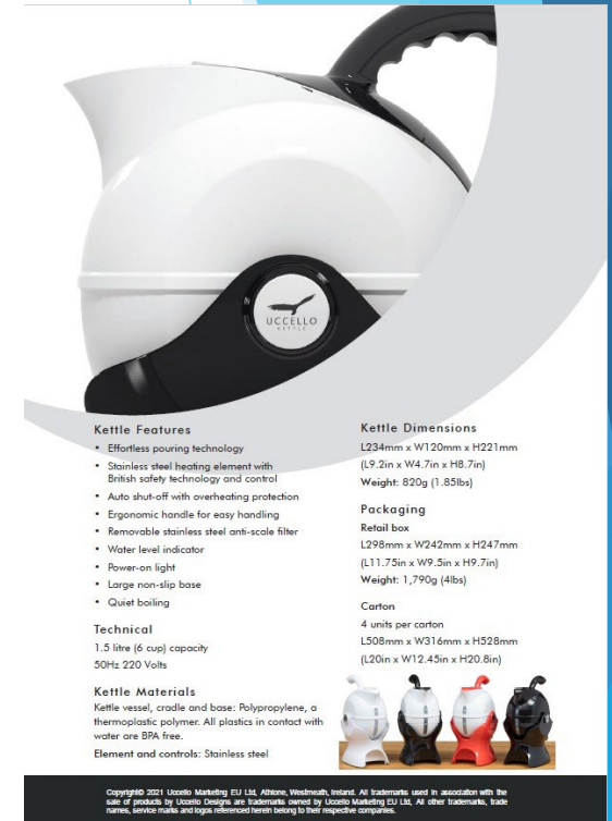
Back of flyer